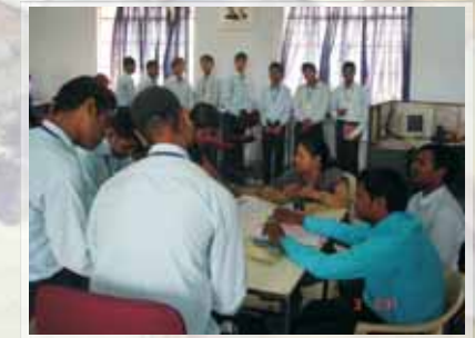
BASIC ELECTRONICS LAB