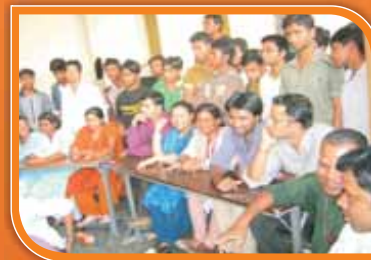
Esteemed Faculty members as Judges in Robotix, Celegance 2011