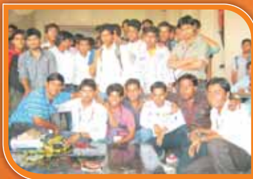
The Organising Committee Members of Robotix, Celegance 2011